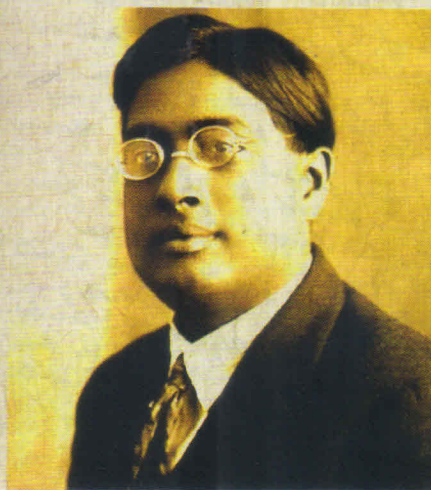
Satyendra Nath Bose

T HE 4 th of June 1924 marks a pivotal moment in the history of physics — a moment when a young Bengali professor, Satyendra Nath Bose, penned a letter to Albert Einstein that would eventually revolutionise the understanding of quantum mechanics and statistical physics. Despite his initial scepticism regarding whether Einstein would even read his letter, fate intervened favourably. Einstein not only read and translated Bose's work but also recognised its profound implications, leading to its publication in renowned physics journals. This correspondence laid the groundwork for Bose statistics and paved the way for ground-breaking discoveries in the field of quantum mechanics. As this year is the centenary of this monumental event, it is imperative to explore how Bose's contributions have reshaped the world of physics, leading to the discovery of Bosons, the development of Bose-Einstein condensation, and advancements in superconductivity and superfluidity.