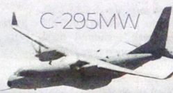
16 aircrafts to be assembled in Spain by Airbus 40 aircrafts to be manufactured in India by Tata Consortium

In a major boost to 'Make in India', a defence aircraft manufacturing project has been sanctioned in Vadodra, Gujarat. Airbus Defence and Space, S.A., Spain and India's TATA Consortium will jointly manufacture transport aircraft for the Indian Air Force at the plant. The plant is being set up as part of the deal between the Government of India and Airbus Defence and Space for the procurement of 56 C-295MW transport aircraft and associated equipment for the Indian Air Force. As part of the contract, 16 aircraft will be delivered in flyaway condition and 40 will be manufactured in India. This is the first project of its kind in which a military aircraft will be manufactured in India by a private company. The total cost of the project is Rs 21,935 crore. The project offers a unique opportunity for the Indian private sector to enter into technology intensive and highly competitive aviation industry. The TATA Consortium has identified more than 125 in-country MSME suppliers spread over seven states. This will act as a catalyst in employment generation in the aerospace ecosystem of the country and is expected to generate 600 highly skilled jobs directly, over 3,000 indirect jobs and an additional 3,000 medium skill employment opportunities with more than 42.5 lakh man hours of work within the aerospace and defence sector of India. Nearly 240 engineers will be trained at Airbus facility in Spain.