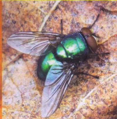
A green bottle fly, Chrysomya sp.