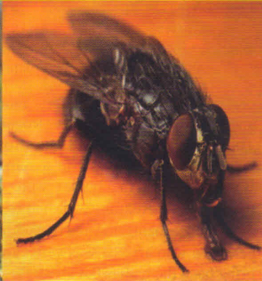
A blue bottle fly, Calliphora vicina