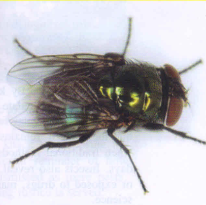
Black blow flies Phormia regina

I N the tense climax of Thomas Harris's novel, The Silence of the Lambs , FBI agent Clarice Starling sits across from a seemingly ordinary man, her nerves on edge, trying to mask her growing suspicion. Suddenly, a Death Head Hawkmoth flutters into view, a rare insect not native to the area, but unmistakably familiar. The same moth had been found in the throats of the victims, a signature left by the serial killer. And now this moth was in this man's house. In that instant, Clarice knew without a doubt that she was sitting face-to-face with Buffalo Bill himself, the psychopath responsible for the gruesome murders. This was the man she had been hunting, the elusive serial killer, his identity betrayed by a single, silent clue from the insect world. This chilling moment underscores a powerful truth: in the world of crime, even the smallest clues can unmask a killer. Welcome to forensic entomology, where insects serve as nature's tiny detectives, revealing secrets that might otherwise remain hidden.