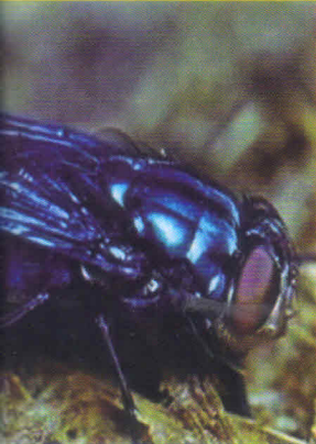
Bottle fly, Calliphora sp