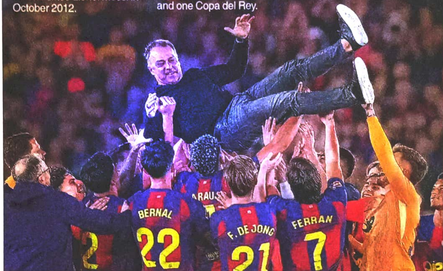
Barcelona players throw coach Hansi Flick in the air as they celebrate the 29th La Liga title at Camp Nou on Sunday.