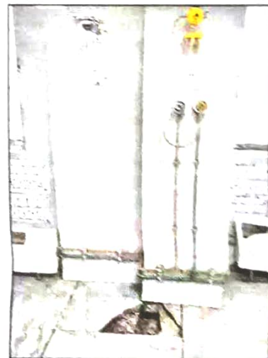
A damaged area in the ward

The senior state health department official said a new building on the NRS hospital premises has been built to relocate the ward.