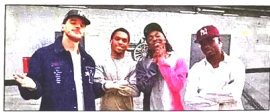
Arsenal players (from left) Declan Rice, Jurrien Timber, Eberechi Eze and Bukayo Saka pose in front of the Emirates Stadium on Wednesday after partying the whole night.

Striker Viktor Gyokeres's arrival last summer also helped. At times, the new No. 14 struggled, and as usual, he was being branded as a bully against weaker rivals. Still, he managed 21 goals in all competitions till now and 14 in the league. A very good first sea-