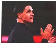
Arsenal manager Mikel Arteta acknowledges the applause during the lap of appreciation after the Burnley match on May 18. It was Arsenal's last home match of the season.

In 2019-20, Arteta's Arsenal finished eighth, and the