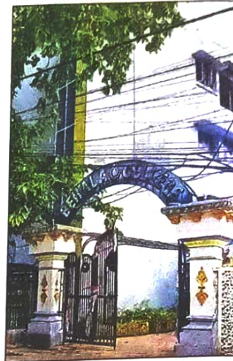
Ramakrishna Mission Residential College, Narendrapur; (right) Behala College

institutions run by the Ramakrishna Mission and St Xavier's College.