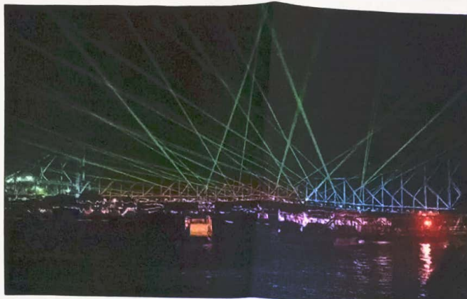
A laser show lights up Howrah Bridge as visitors at Millennium Park (right) gather to view it on the eve of International Yoga Day.