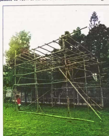
Deshapriya Park and (right) Elliot Park being prepared on Saturday for Yoga Day