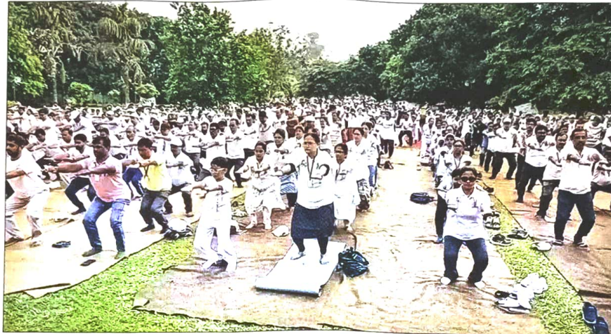
KMC employees perform yoga at Elliot Park on Sunday

"About 1,000 employees from KMC headquarters took