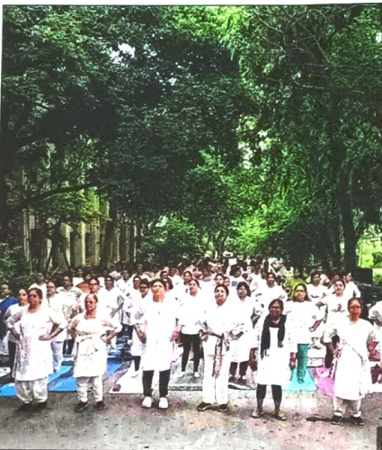
Employees of Lady Brabourne College at a yoga session

part in the session at Elliot Park. Employees from other offices of KMC in the boroughs and wards took part in the sessions held at other parks across the city," said a KMC employee.