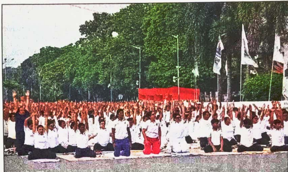
International Yoga Day being observed on Red Road and (below) at Eden Gardens on Sunday morning.

Several private hospitals organised yoga sessions on Sunday. Manipal Hospitals, EM Bypass, held a session on its premises, attended by more